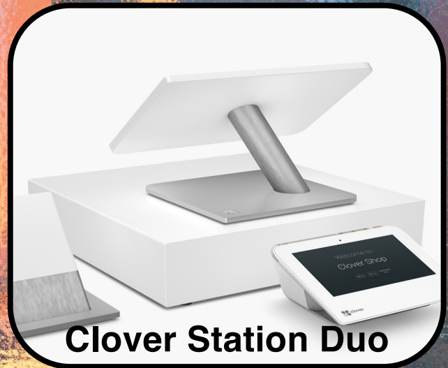
Clover Station Duo