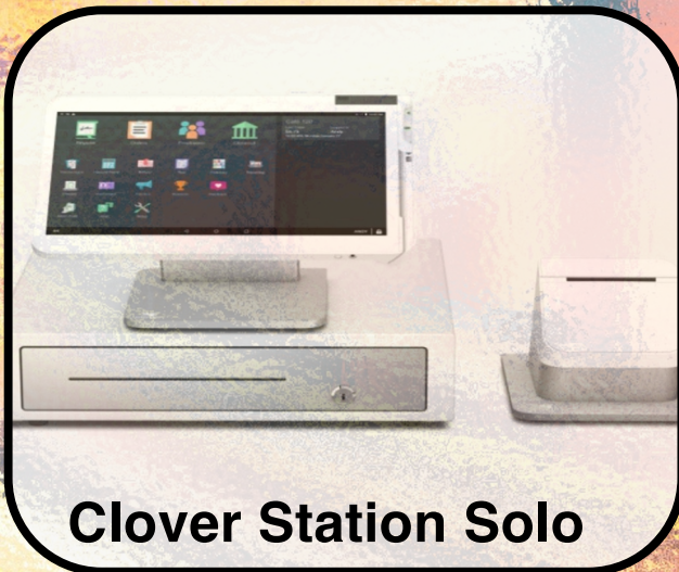
Clover Station Solo